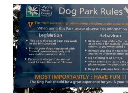
Typical entry signs