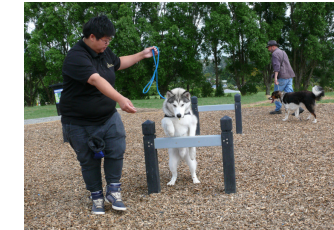
Typical agility jump