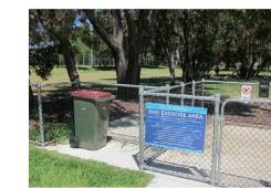
Double entry gates