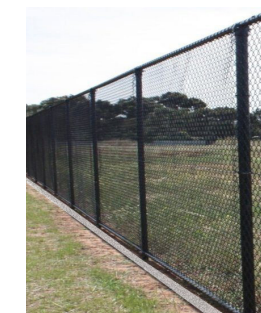
Fence, with flush 150mm concrete strip beneath