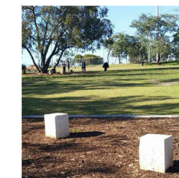
Block seating at sand play