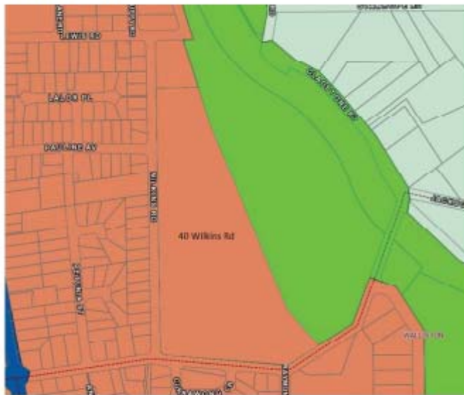
New Zoning: Urban