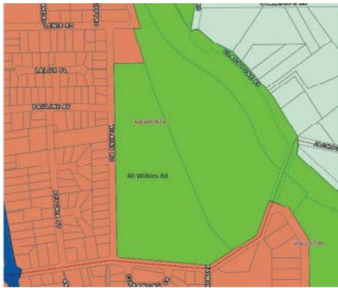
Existing Zoning: Parks and Recreation