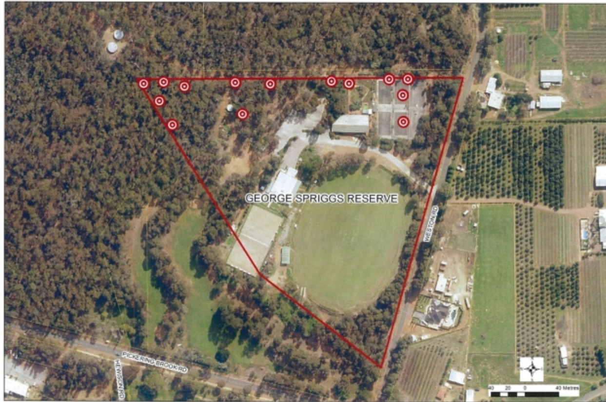
GEORGE SPRIGGS RESERVE