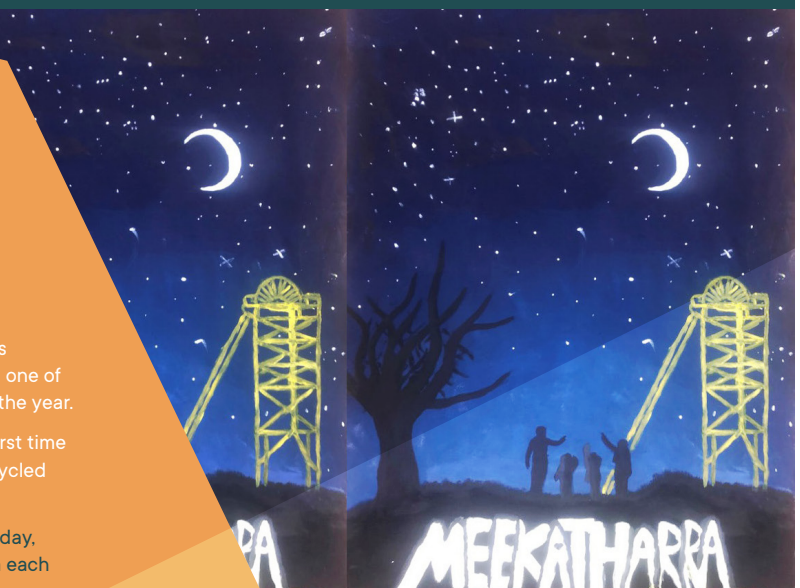
2019 Overall Winner – Shire of Meekatharra

Artwork will be displayed in Yagan Square from Monday, 6 September to Sunday, 26 September , at 12:00pm each day (subject to changes by Yagan Square).