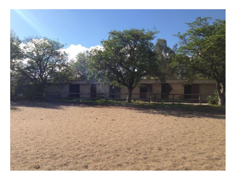
Plate 4 - Former Stables to be used for Product Display

Application for Planning Approval Lot 150 Welshpool Road East, Wattle Grove