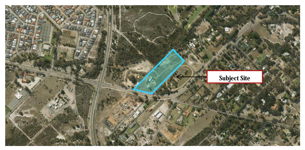
Figure 1 - Aerial Locality Plan (subject site outlined in blue)

The subject site is located on the north side of Welshpool Road East, east of the Tonkin Highway. An Aerial Locality Plan is included at Figure 1 below.