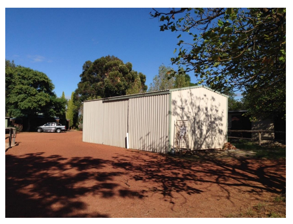
Plate 1 - Existing Outbuilding to be used as Storage Shed

The south-western half of the site, over which the Garden Centre is proposed to be located, contains an existing dwelling, stables, outbuildings and other ancillary infrastructure. The north-western part of the site contains open grassed areas and scattered vegetation. Site photographs are included as Plates 1 - 4 below.