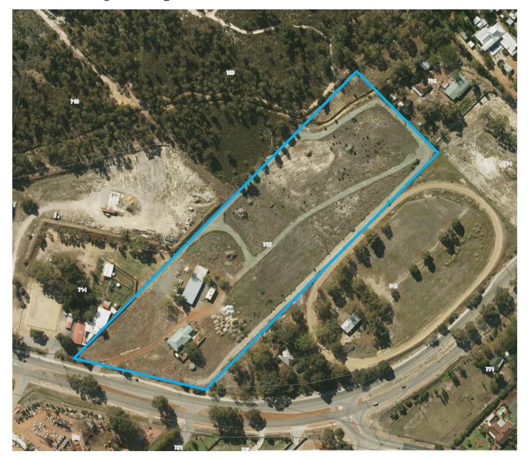
Figure 2- Aerial Photograph

The rear (north-eastern) part of the site remains largely undeveloped. An aerial photograph of the site depicts the nature of existing land use (Figure 2).