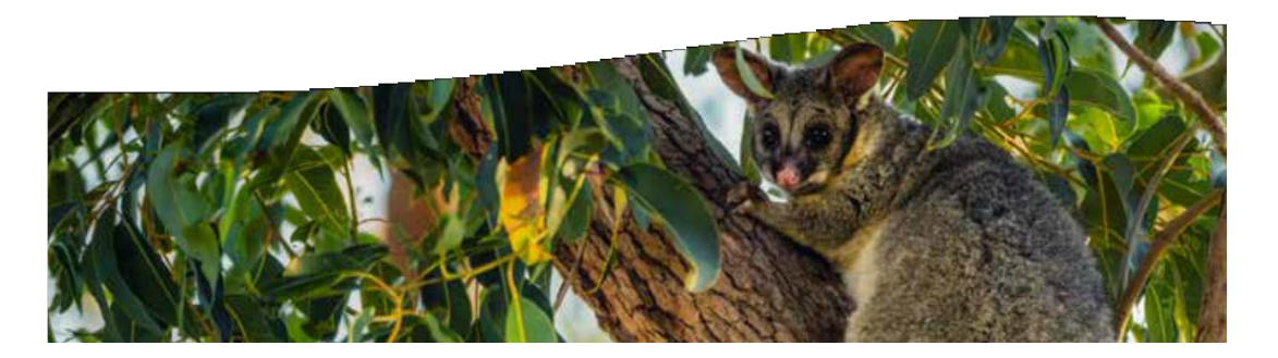
City of Kalamunda CCTV Policy and Strategy