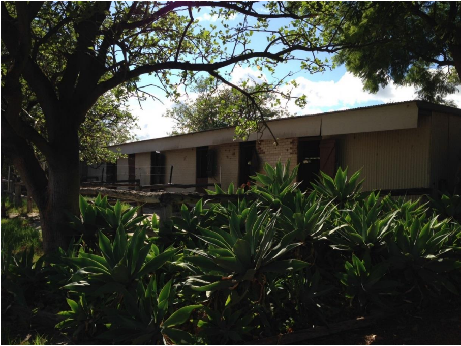
Plate 3 - Former Stables to be used for Product Display