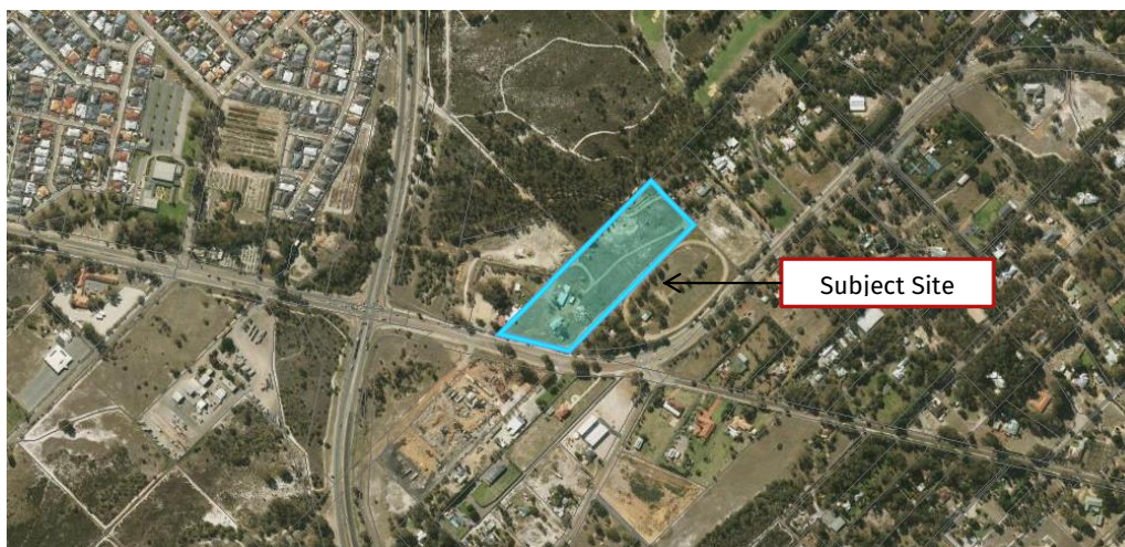
Figure 1 – Aerial Locality Plan (subject site outlined in blue)

The subject site is located on the north side of Welshpool Road East, east of the Tonkin Highway. An Aerial Locality Plan is included at Figure 1 below.