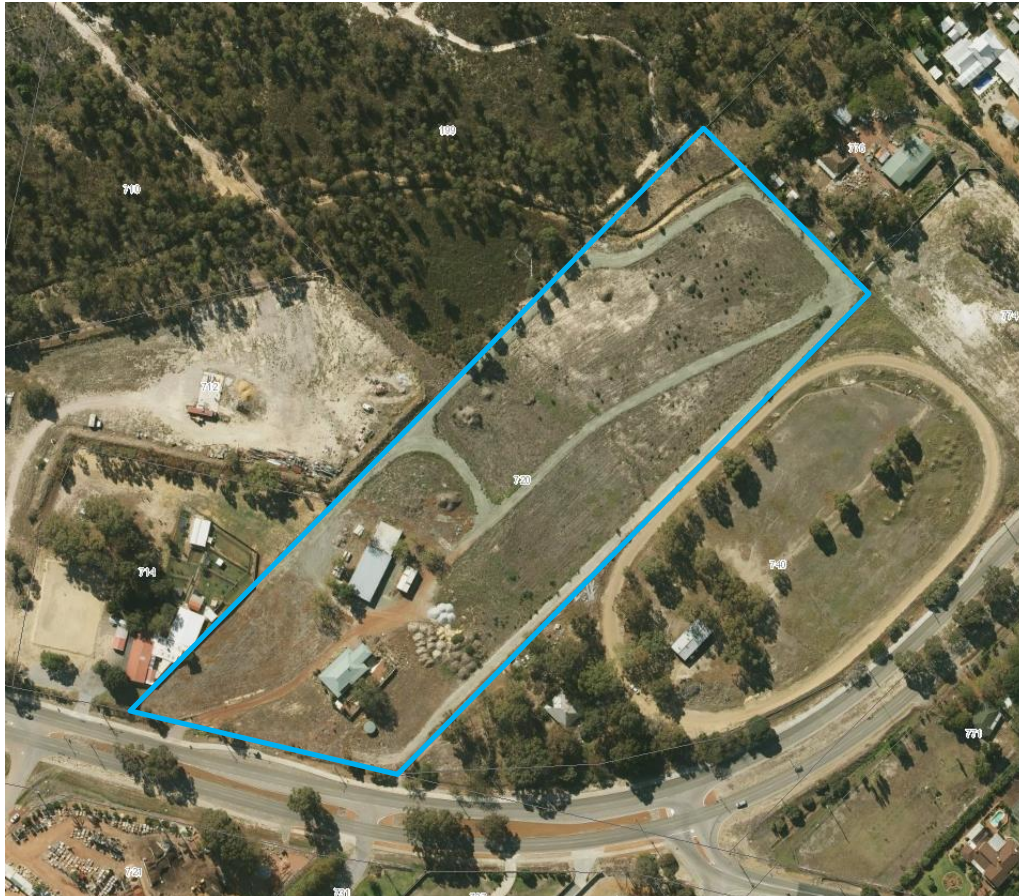
Figure 2– Aerial Photograph

The rear (north-eastern) part of the site remains largely undeveloped. An aerial photograph of the site depicts the nature of existing land use ( Figure 2 ).