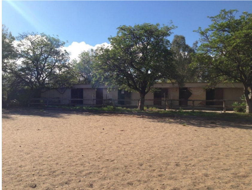
Plate 4 – Former Stables to be used for Product Display