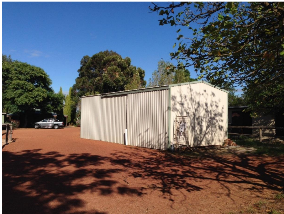
Plate 1 – Existing Outbuilding to be used as Storage Shed

The south-western half of the site, over which the Garden Centre is proposed to be located, contains an existing dwelling, stables, outbuildings and other ancillary infrastructure. The north-western part of the site contains open grassed areas and scattered vegetation. Site photographs are included as Plates 1 - 4 below.