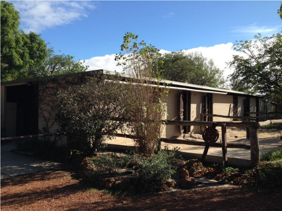
Plate 2 - Former stables to be used for Product Display