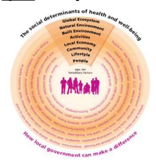
Figure 1: How local government can make a difference in health and wellbeing

Promoting community wellbeing is about intervening "to change those aspects of the environment which are promoting ill health, rather than continuing to encourage individuals to change their behaviours and lifestyles when, in fact, the environment in which they live and work gives them little or no choice or support for making such changes". <sup>2</sup>