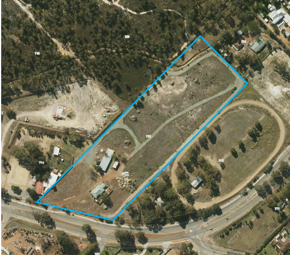
Figure 2– Aerial Photograph

The rear (north-eastern) part of the site remains largely undeveloped. An aerial photograph of the site depicts the nature of existing land use ( Figure 2 ).