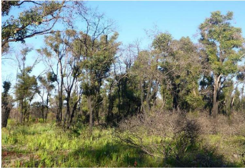
Pic 1; Although the trees (jarrah/marri) are recovering from the fire their form and health is very poor.