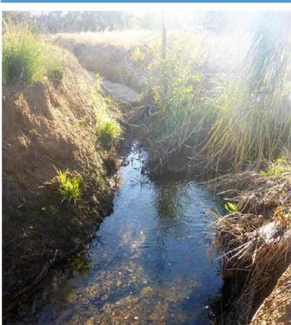
Pic4: The general condition of the main channel. Weeds will be sprayed and the batter slopes revegetated with sedges and rushes as per species list

Undertake maintenance programs within the revegetated area only Restore the habitat of native aquatic biota in key wetlands and waterways