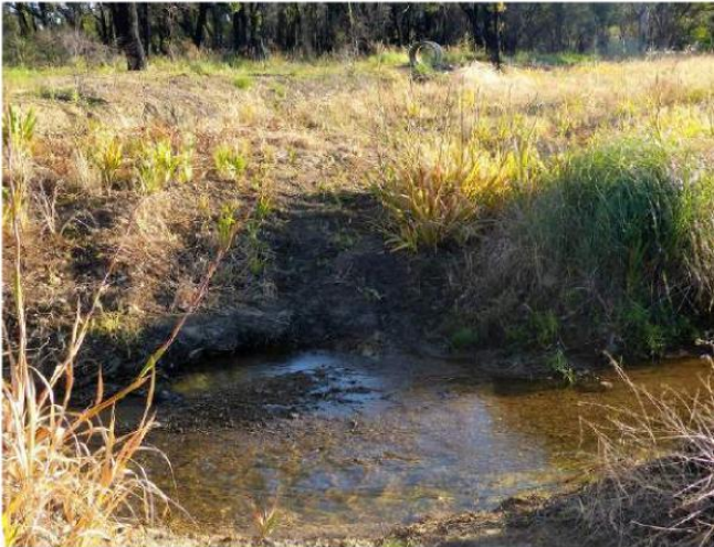
Pic 5 : The only crossing onto the main area which will be revegetated. This crossing will be used for access to the main area