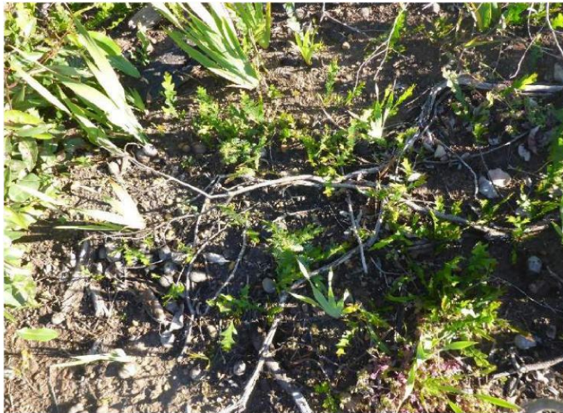
Pic 2: A severe infestation of Watsonia is hindering the regrowth of groundcover and shrubs

As a result of the very poor hygiene and form of these trees they were pushed up by the current owner.