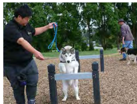
Some of the possible dog exercise equipment