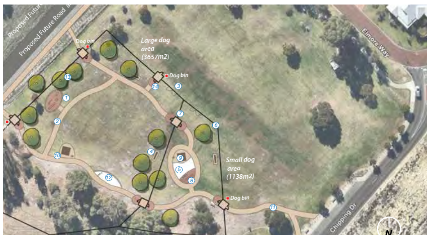
Concept plan - Elmore Park, High Wycombe