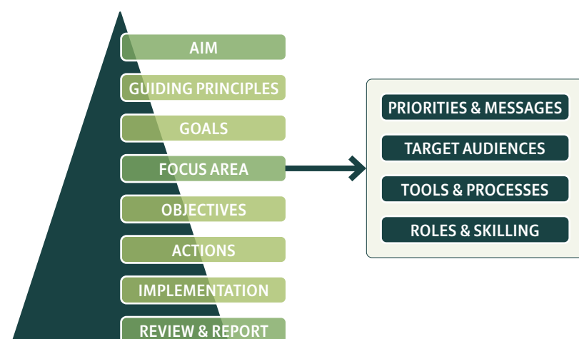
Diagram 1 Conceptual Framework for the Advocacy Strategy