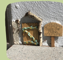
Provincial Real Estate