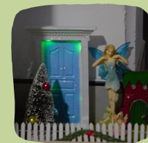
Hello World Travel