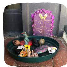
Wild Seasons Flower