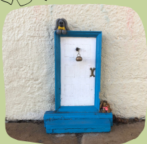
The Clip Joint