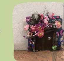
Our Flower Studio