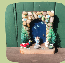
Kalamunda Arts and Crafts